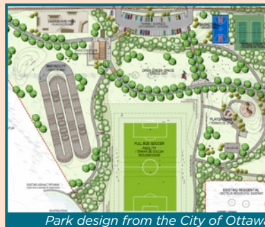
Park design from the City of Ottawa

There is excitement that a $2M park is coming to Greely Village Centre. Want to learn more about the proposed park and have your say? Visit the City of Ottawa website.